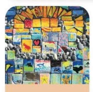
WP2. PartArt4OW Framework - Open calls