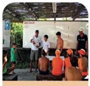
WP3. PartArt4OW support and Accelerator program